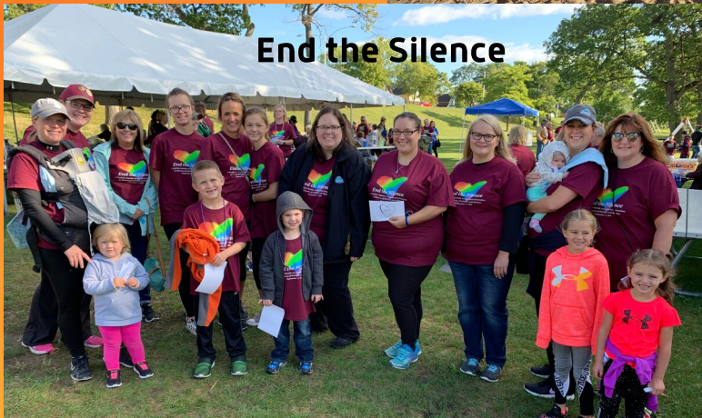
End the Silence