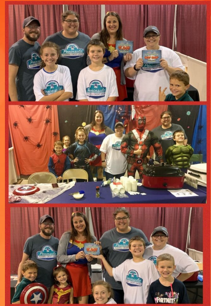
Soup'R Chili Challenge