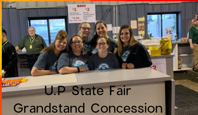
U.P. State Fair Grandstand Concession