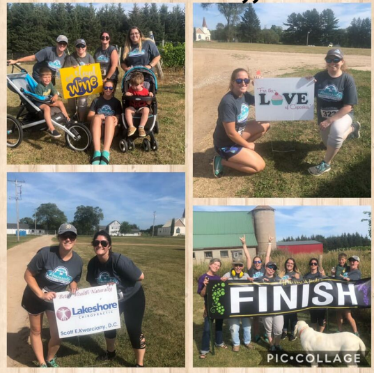
Bark River Lions Off the Vine