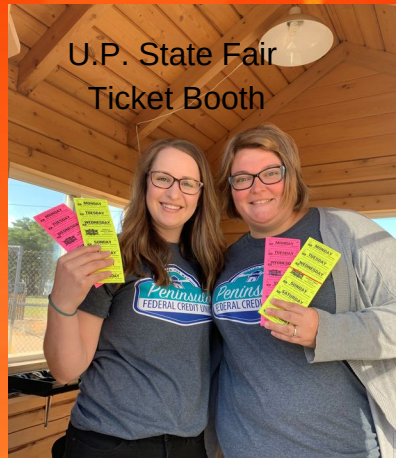
U.P. State Fair Ticket Booth