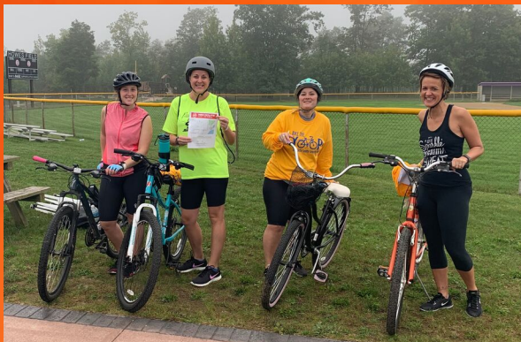
Chamber of Commerce Century Ride