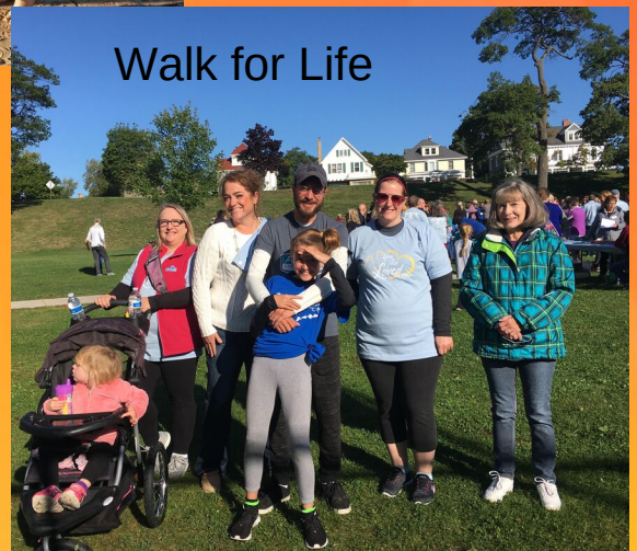
Walk for Life