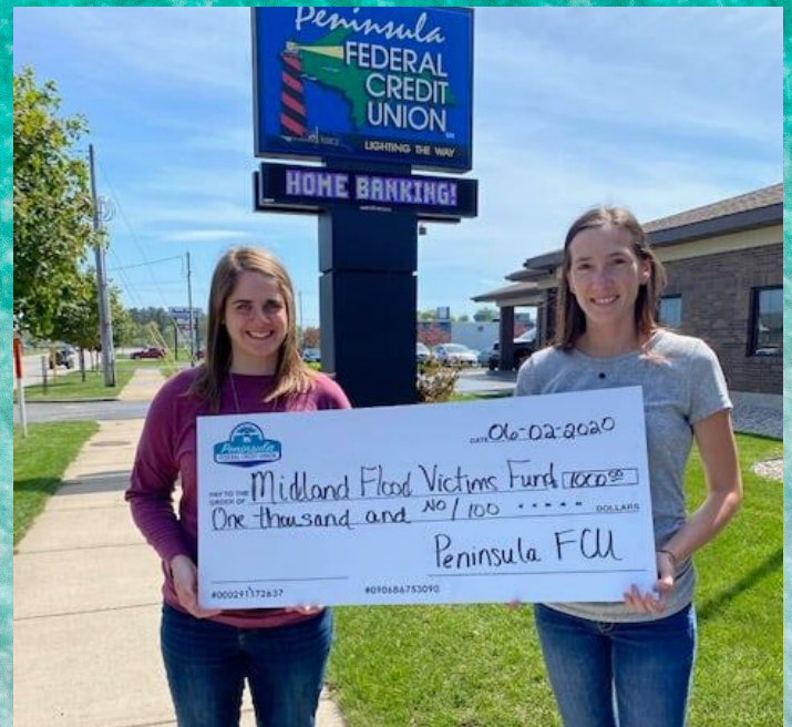
Donation to Midland Flood Victims Fund