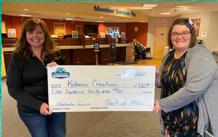
Donation to Kobasic Creations for face shields for our local healthcare workers!