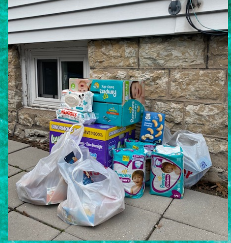
PFCU Staff donated to Pregnancy Services of Delta County