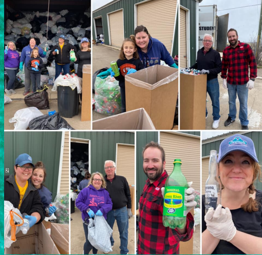
PFCU helped sort $21,000 worth of returnables for the homeless.