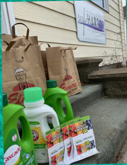
PFCU Staff donated to Tri-County Safe Harbor