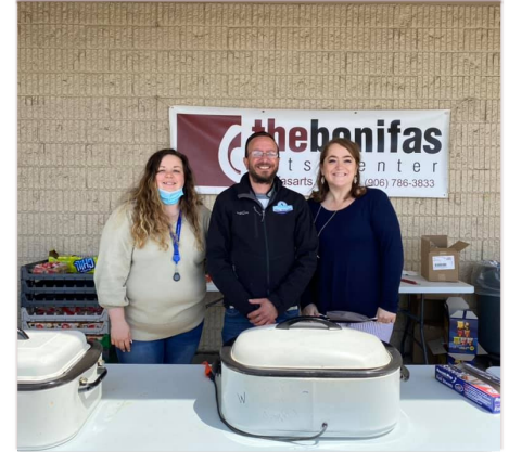
The Bonifas Arts Center Brat Sale