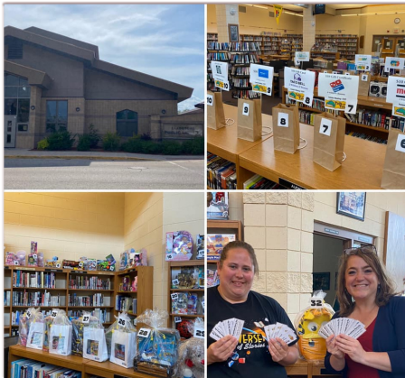
Gladstone Library Summer Reading Program

PFCU STATS as of 5/31/21 Assets $247,780,476 Loans $198,978,860 Deposits $224,547,505 Members 13,464