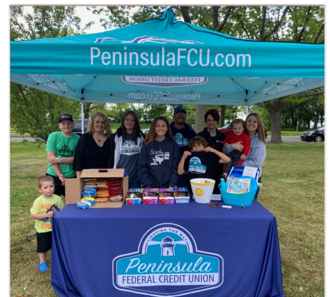
Movie In The Park