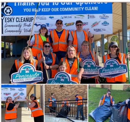
Esky Clean UP