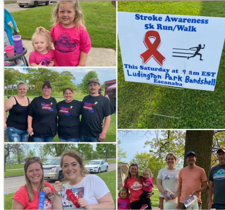
OSF Foundation Stroke Awareness Walk